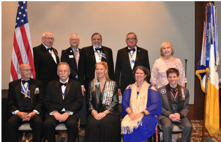
Saturday night photos included individual guests who brought greetings from the National SAR, NCLASSAR, Florida State DAR, and Florida State Society C.A.R..

We hope everyone has a great summer. Safe travels if you are going to Savannah or anywhere else.