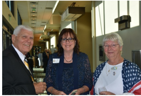
Happy Hours on Friday and Saturday were moved from 5 o'clock to 6 o'clock, but no one seemed to care.